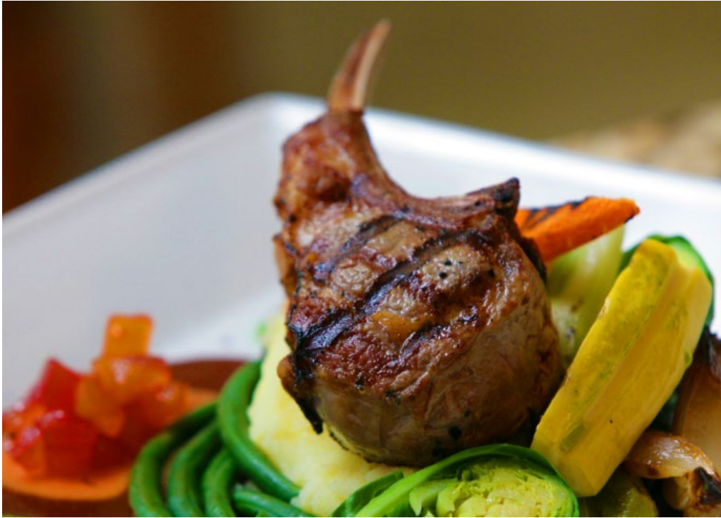
FOOD FOR THOUGHT