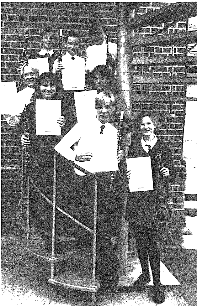
Smiling faces of the successful musicians

Some of these pupils will be taking part in the school band's tour of Australia next summer. Generous sponsorship has already been received from Thatcham Rotary Club and The Regency Hotel, but the members of the band are still seeking further funds to cover their costs and will be taking part in various money raising activities.