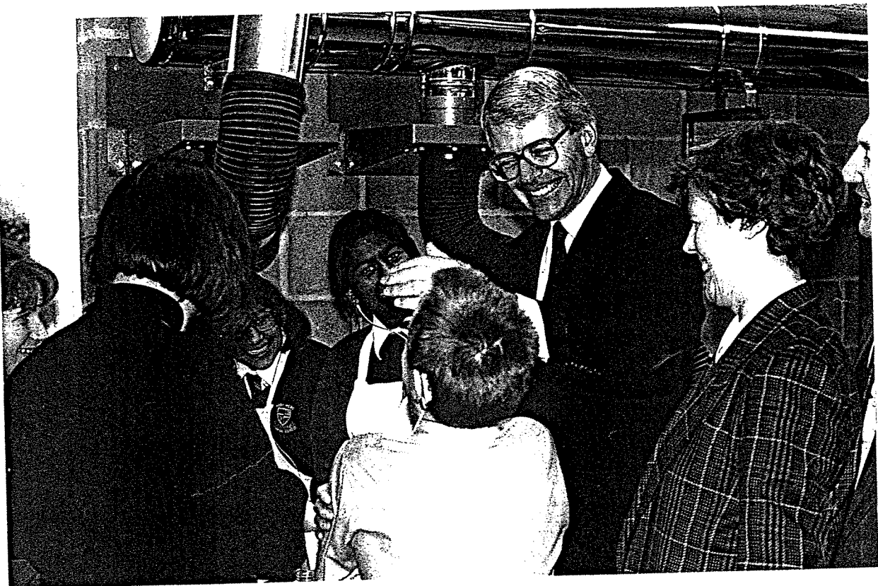
John Major chats to pupils in C.D.T. Block

Speculation that a V.I.P. was coming was rife for days beforehand, but the secret was well kept. On the morning of Friday, 29th November, the news was broken to the pupils that premier, John Major, had asked to visit the school. Feelings were mixed - many pupils were disappointed the mystery guest was not Michael Jackson but most were delighted that the P.M. was eager to find out more about the school first hand.